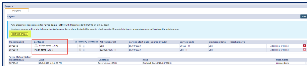
Patient Contracts Page - Refresh Page

Once saved, the Contract appears in the Contract page, pending the Alt. Patient ID . Allow a few seconds, for the system to refresh. Click on the Refresh Page button, as needed.